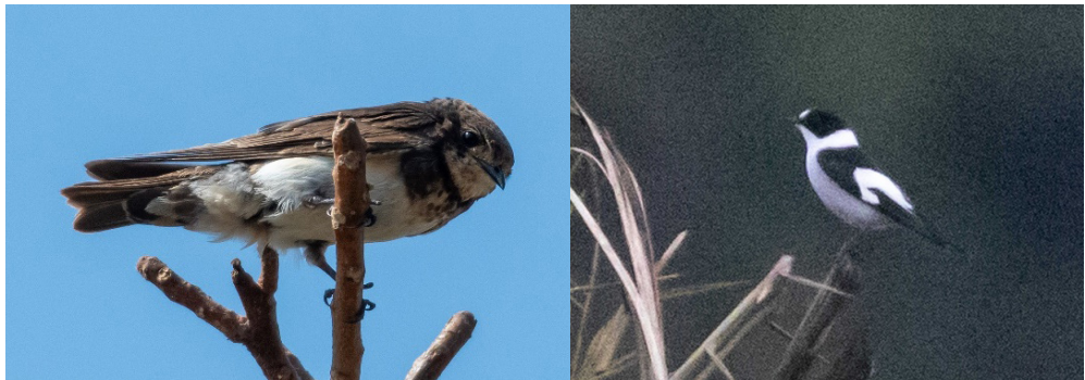
Figure 5. South African Cliff Swallow Petrochelidon spilodera (photo: Raphaël Nussbaumer).

Third record for Kenya. A single bird seen and photographed at Aruba Lodge, Tsavo East National Park on 6 July 2020 (Fig. 5; R. Nussbaumer, A. Nussbaumer and M. Djambi).