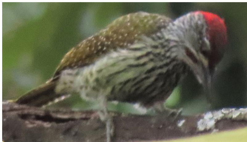
Figure 7. Golden-tailed Woodpecker Campethera abingoni suahelica.