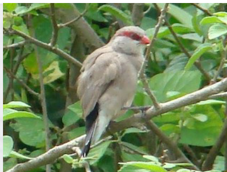
Figure 2. Black-rumped Waxbill Estrilda troglodytes.