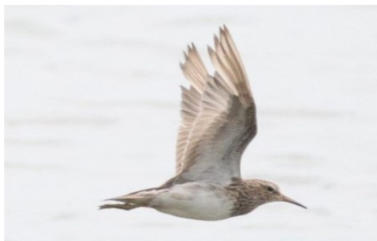
Figure 1. Pectoral Sandpiper Calidris melanotos.